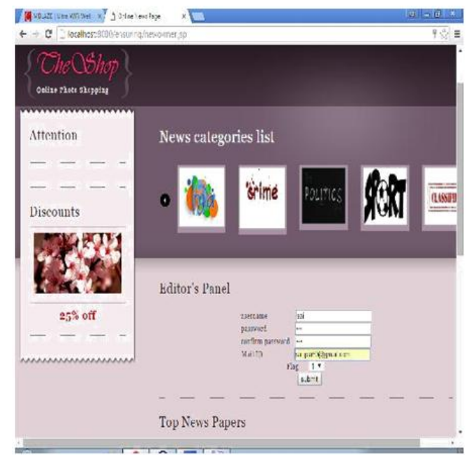
Fig 1: Database maintains the uploaded information of the editor