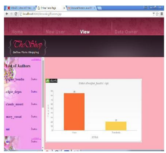
Fig 3: Bar chart representing the number of views made Hence an assessment is made by a bar chart generating the number of views made on each and every data

Sixth International Conference on Emerging trends in Engineering and Technology (ICETET'16) www.ijera.com ISSN: 2248-9622, pp.67-71